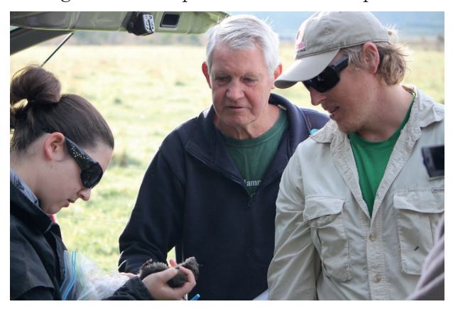
Figure 2: The Atlas of Life in the Coastal Wilderness is a regionally-based, community-led project that has contributed over 11,000 species sightings to the Atlas of Living Australia in less than four years. It is a rich contribution to a large, long-term and critical data resource for the nation. Atlas of Life in the Coastal Wilderness, 2014.

Like any scientific endeavour, the appropriateness of citizen involvement and best form for that involvement to take have to be carefully evaluated. <sup>9,10</sup> Projects that require complex observation or data collection techniques will often call for skills that only years of professional training and experience provide. However, many projects are well suited to participation by members of the community, who can follow the principles of scientific inquiry<sup>11</sup> to make valuable contributions.