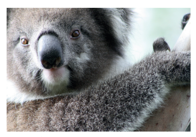
Figure 3: Over 500 people searched for koalas on one day in South Australia, recording 1500 sightings as part of The Great Koala Count. Researchers developed a model of koala distributions from the spatial data collected. The project was run as a collaboration between the University of South Australia, ABC Local Radio, the South Australian Government, CSIRO and the local community. Philip Roetman, 2011.

More complex projects require scientists to provide more training or support for citizen scientists. They typically involve fewer participants<sup>6</sup> or operate on a smaller scale (Figure 4) to ensure that high-quality evidence is obtained.