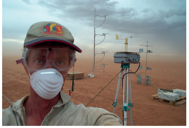
Figure 7: Citizen scientists in the DustWatch program monitor dust activity using instruments such as deposition traps and high volume air samplers.