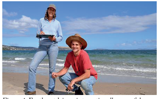
Figure 4: Earthwatch is an internationally successful model where citizen scientists join professional scientists to investigate environmental issues. In Australia, Earthwatch expeditions have contributed to over 300 peer-reviewed scientific papers. Earthwatch, 2013.

For society: new information for government decision-making, greater interest in science and understanding of scientific principles, greater