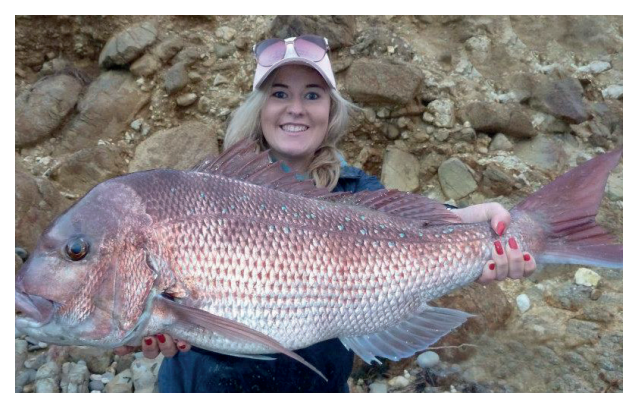
Figure 6: Participants in Range Extension Database and Mapping project (or 'Redmap') record and share observations of marine species that are unusual to a given area via a website or smartphone app. The data helps scientists to map changes in the distribution of marine species against changes in the marine environment. All photographic observations are verified by a member of Redmap's network of 80 scientists. Jonah Yick, 2015.

Moreover, advances in instrumentation such as devices that monitor and record temperature and acidity make it possible for non-experts to take reliable and precise measurements of an increasing number of parameters (Figure 7).