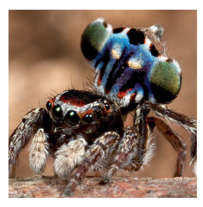
Figure 1: Peacock spider; Maratus harrisi, discovered by citizen scientist Stuart Harris.

Australian citizen scientists have discovered new species (Figure 1), played a role in breakthroughs on debilitating diseases<sup>4</sup>, identified and classified distant galaxies<sup>5</sup>, and contributed to new ecological theories.<sup>6</sup>